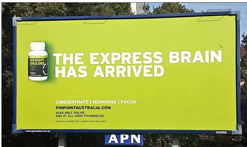
Billboard at Glenferrie Railway station, near Swinburne University (photographed 2/05/2018)